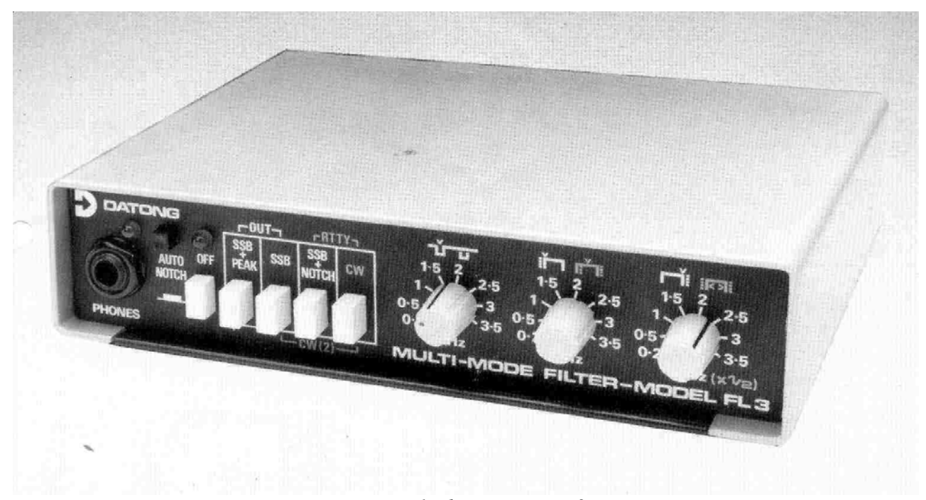
Figure 1: the Datong FL3

I bought the Datong FL3 audio filter several years ago after trying one at Lowe Electronics. Its auto-notch filter removes heterodynes and additional tweaking removes other hets if required. All in all it's a much respected filter and has superb filtering capabilities.