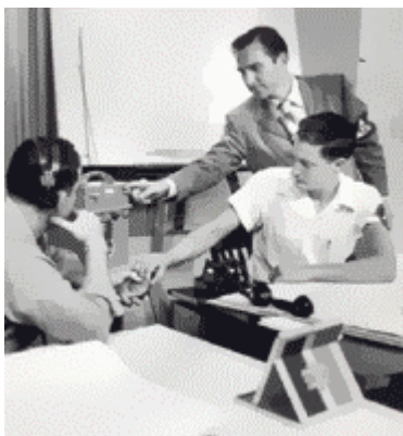
← Civil Defence Radio Class; 1950s

I knew that the Defense Civil Preparedness Agency is now known as the Federal Emergency Management Agency (FEMA). It is responsible for federal assistance in emergencies such as natural or man-made disasters or defense-related incidents. A visit to the FEMA library in downtown Washington revealed more about DIDS and WGU-20.