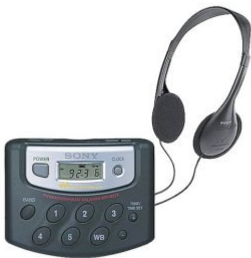
Sony SRF M37V