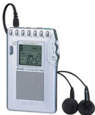
Sony SRF-T615 JE