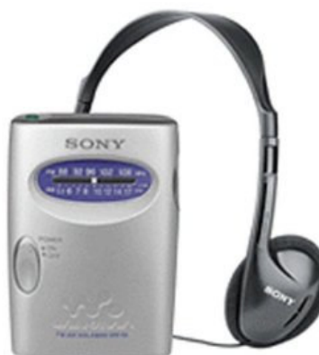
Sony SRF 59

The least expensive recognized Ultralight radio is also the currently most popular: the SRF-59, at around $15 USD. If you own a shirt pocket portable that you would like to utilize in Ultralight DXing, one that is not yet recognized by the Committee, you should contact Gary DeBock (D1028Gary@aol.com) and ask for a review of that radio model by the Definitions Committee.