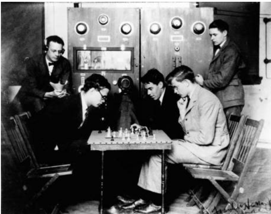
← Live Chess Match at WABQ in the 1920s

The University of Wisconsin was one of the first university stations to broadcast voice transmissions. It also continued to operate during WWI (the other ones were forced to shut down). I think that is why it claims to be the earliest continuously operated broadcast station. But you see that it depends on the specific criteria you use.