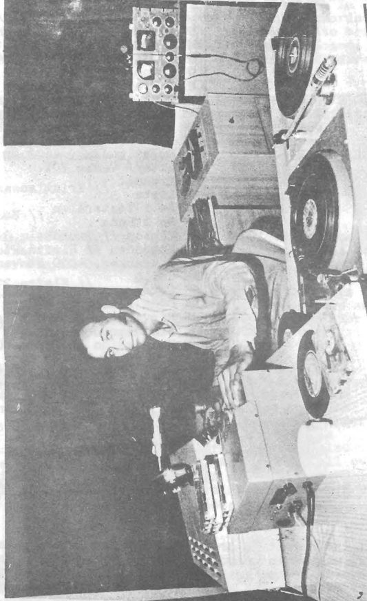
Main control room