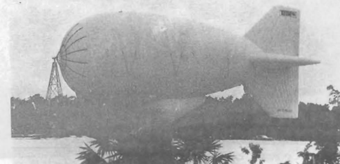
Westinghouse's aerostat is being investigated as a means of broadcasting TV, radio, and other modern communications over a wide area. The system might have appli- cation in providing com- munication services in emerging nations and other areas hampered by lack of such facilities. Grand Bahama is the scene of the tests.