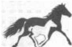
KENTUCKY HORSE PARK