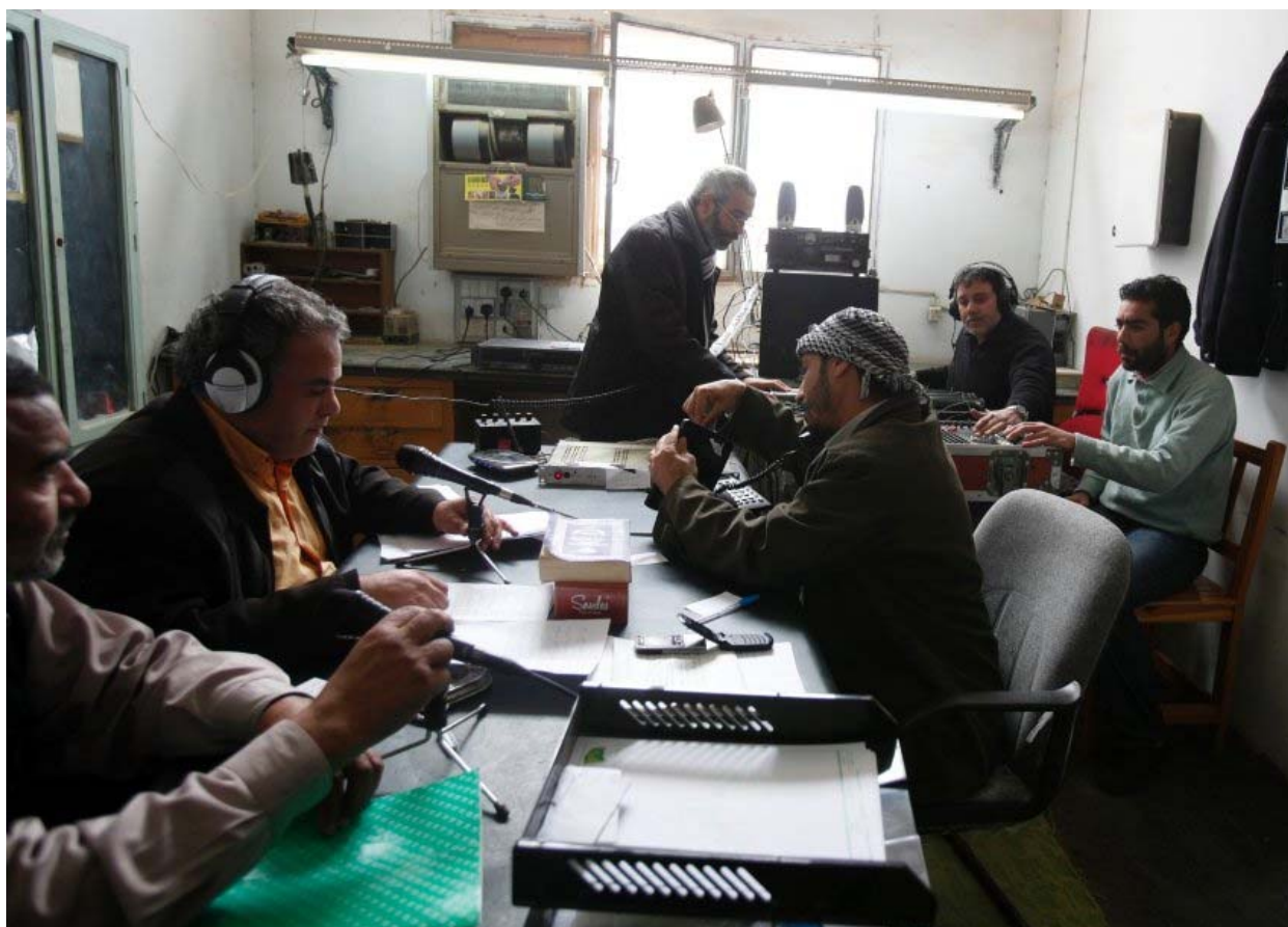
From the studios of Radio Free Libya, 1125 kHz, Benghazi.

// - Parallel to. :00 – On the hour. AC – Adult contemporary. AP – Associated Press. BBD – Big band. C&W – Country and western. CCz'R – Contemporary Christian radio. CHR – Contemporary hit radio. CID – Code ID. CL – Call letters. COL – City of license. EE – English. EZL – Easy listening. FF – French. GOS – Gospel. Hi – A joke; the ham radio equivalent of :-). LID – Legal ID (i.e., CL and COL near the ToH). LSR – Local sunrise. LSS – Local sunset. NBA – National Basketball Association. NFL – National Football League. NHL – National Hockey League. NPR – National Public Radio. OC – Open carrier. OLD – Oldies. PSRA – Pre-sunrise authority. PSSA – Post-sunset authority. QRM – Man-made interference (power lines, other stations, etc.). QRN – Natural interference (lightning, etc.). QTH – Location. REL – Religious. ROK – Rock'n'roll. RS – Regular schedule. $ - Stereo. SID – Singing ID/jingle. SRS – Sunrise skip. SS – Spanish. SSB – "The Star-Spangled Banner." SSS – Sunset skip. TC – Time check. ToH – Top of the hour. TT – Test tones. UC – Urban contemporary. VID – Voice ID. WW1 – Westwood One.