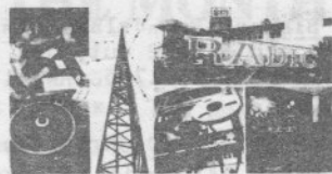
RADIO O BANDEIRANTES SAO PAULO - BRASIL