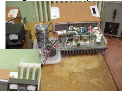
Above. External LF power amplifier. Left. Laptop computer used to generate signal and transmitter.

Photographs of the equipment used in the second attempt on July 7th 2001 photos by Mark Nicholls.