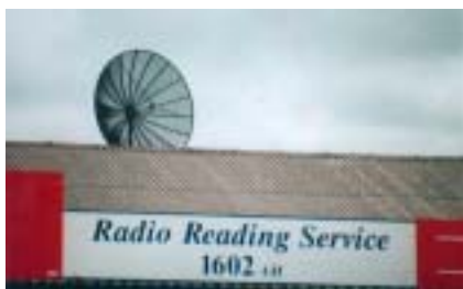
The satellite receiving antenna atop the studios of the Radio Reading Service in Levin