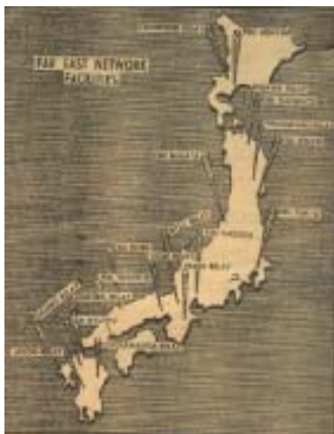
Japan Far East Network 1955