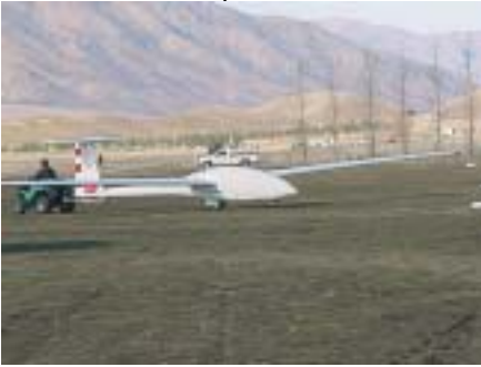
Towing out the glider to prepare for take-off.