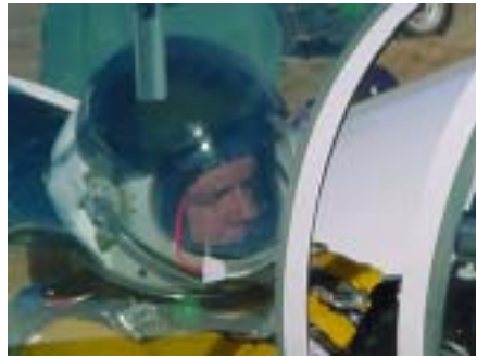
Steve Fossett suited up and ready to go.