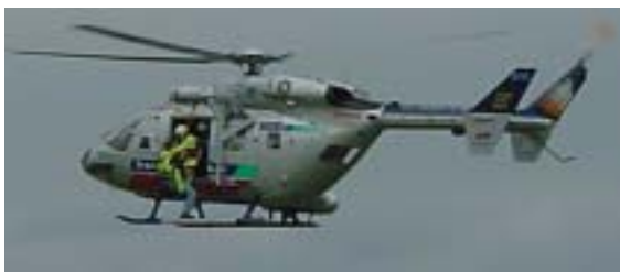
Tranz Rail Rescue Helicopter at Taieri airfield (near Dunedin Airport) at the 75th Anniversary of the Otago Aero Club

5290 0527 ZLG 38 to 39. Long conversation on antenna matching. These two guys on air regularly and both in Rotorua area. PC 5473 0435 DC 28 Dave, located in Reefon to DC 29 Jeff in Nelson, conversation about Wx etc. PC 5547 0950 San Francisco/North West 947. Posn at 0949. FL 330. Temp -46 Cleared to and maintain 350 and report reaching. EM 5547 1008 Navy 176/San Francisco. Copied all. Go ahead. EM 5547 1009 American 14/San Francisco. Go ahead posn. Call ? 132.15. EM 5574 0738 Delta 341/San Francisco. BJ