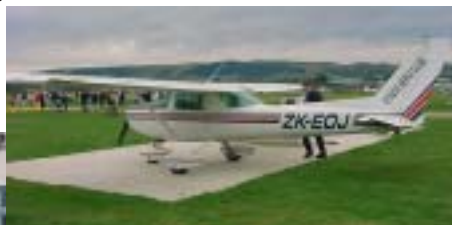
Photo - Above. Cessna 2 seat training aircraft Photo - Left. Pitts Special aerobatic aircraft

6586 1004 New York/Springbok 211. Request FL 390. Call Jacksonville 120.12. Cleared to and maintain 390 and report reaching. Now level 390 at 1011. EM 6586 0958 New York/Varig 4686. FL 360 at 0967. EM 6581 0954 New York/Springbok 211. Posn at 0952. FL 380. Temp -56. EM 6604 0826 Gander Volmet for Winnipeg, Edmonton, Calgary. EM 6637 1102 Freedom 412 to Air NZ flight despatch requesting Wx for Palmerston North and advising arrival 45 minutes early. ISee what we can do to get people out earlier and get to the pub earlier. PC 6945 1014 Aussie outbackers. QSY to 8165, back to 6945, then 11466, back to 6945, then to 8144, finally back to 6945. Also mentioned 4985 as a usable channel. PC