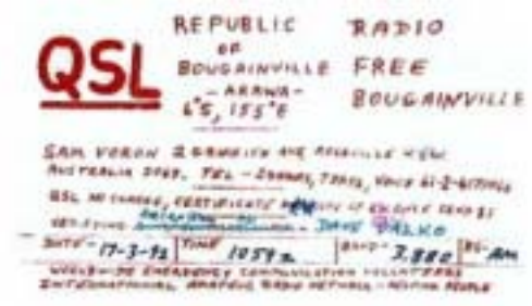
Radio Free Bougainville QSL card

Francis Ona, dissatisfied with the peace process and perhaps also feeling sidelined, seized weapons slated for disposal and retreated into the mountains of central Bougainville around Panguna mine with a small band of supporters. He declared sovereignty as President of the Mekamui National Congress, which seeks independence for Bougainville. (Mekamui translates as "Holy Land" in the local dialect