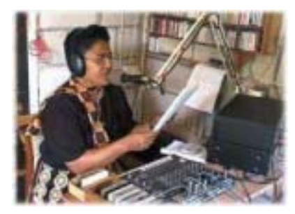
93FM Tonga.

Pacific nations are being flooded with American and now British evangelists securing AM/ FM/SW/TV facilities. The list of countries hosting them grows longer every year, and New Zealand based UCB International (which has a partnership arrangement with HCJB and TWR) is also heavily involved. UCB is a spin-off from Radio Rhema. They have FM stations in Tonga, Vanuatu and Papua New Guinea and expect to announce new stations in two other Pacific islands shortly. They're also in Australia.