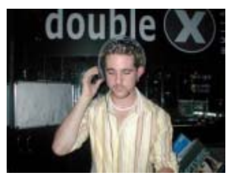
3XX 1611' D.J