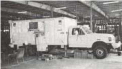
Mobile AFRTS van, Kuwait City, Desert Shield Network

This was probably the most active participation in contingency missions by AFN since WWII. It was my pleasure to be there and heavily involved.