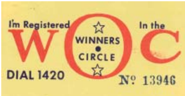
WOC Davenport 1420 AM Winners Circle

The day I arrived for work in Davenport, they put me on air. I was a DJ long before they invented the term. As staff announcer, I played phonograph records, read commercials and served as a local bridge between our local programming and network broadcasts. I was not an immediate success as a radio announcer to put it mildly.