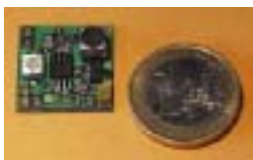
SAT-Service Schneider DRM IF Module

I had originally thought about modifying my AOR AR-7030 for DRM reception, but in the end I decided to purchase a DRM-ready Yaesu FRG-100 from SAT-Service Schneider in Germany. They also sell a very small DRM IF module for installation into other receivers.