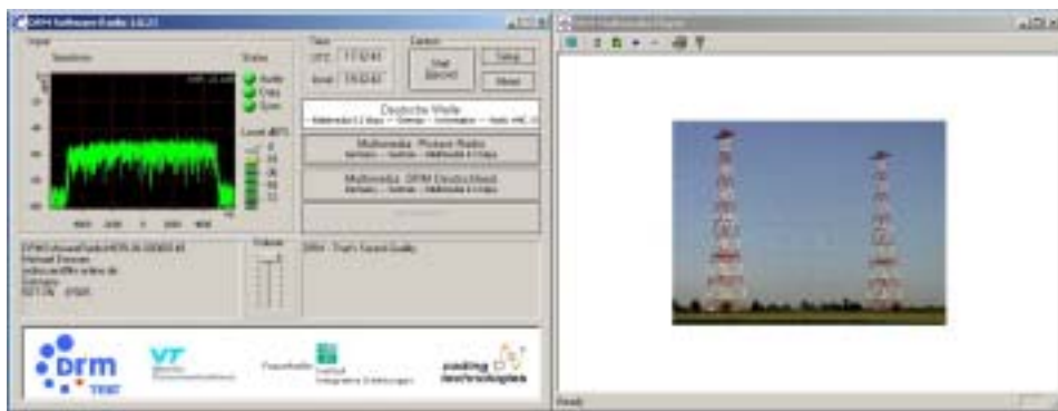
Screen capture of multi-media DRM broadcast

DRM™ offers the potential for totally noise and fading free shortwave reception. In addition it has the ability to carry stereo signals, and multimedia broadcasts, including extra information such as pictures and subtitles.