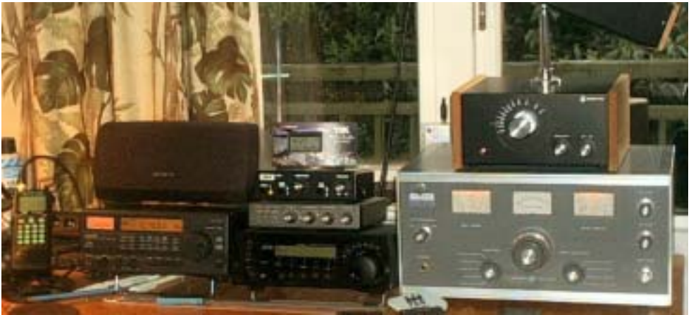
My DX Shack FRG-100/DRM on the left

This is new technology and it has a long way to go yet. True, there is no static or fading, but instead you get dropouts and distortion at times, very similar to listening to an internet radio station via a dialup connection a year or so ago. Having said that, I think how much that technology has improved dramatically over a very short time, and I can't help thinking the same will happen with DRM.