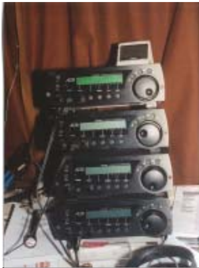
Stack of AOR 7030's

It is sad that we have to experience such an event taking place at Tiwai Point, a home for many years for Southland Branch members of the New Zealand Radio DX League. A location that earned an international reputation in the DX hobby and has become an important icon of New Zealand's wonderful radio history.