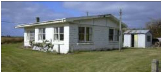
House at Tiwai (Southland)

Most were there from Thursday to Easter Monday. Each evening the conditions varied considerably with the best DX being heard Thursday to Saturday. Conditions tapered off after that. Highlights were many and it is hard to list them, however for me they were: WKAT Classical 1360, 1kw in Miami, WTNI Biloxi MS 1640 and brand-new on air, Radio María in Panamá 1310, WBT in Charlotte North Carolina 1110, ZNS1 The Voice of the Bahamas 1540, HJDL Radio Parisa in Medellin, Colombia 1140, and HCRT6 Radio Paz y Bien in Ambato, Ecuador on 1340.