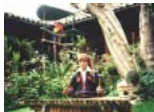
Marimba player in a Patio with Ara Parrots in Chichicastenango, Guatemala.