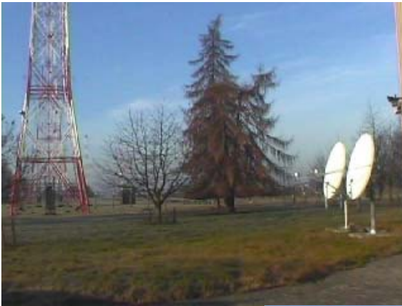
Some more images of Short-wave Radio Station Juelich. (via Ian Cattermole)