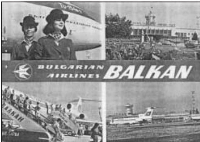
Balkan Bulgarian Airlines.

Again, this area of the contest is open to more competition and with Ron spending less time chasing QSL's these days, your chances of building a unique collection of your own are improving.