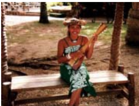
Tahitian girl playing Ukulele.