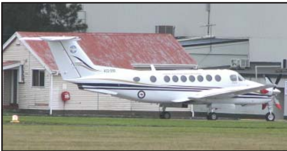
Australian Air Force Beech Super King Air 350 photo taken at Whenuapai Air Force Base on May 11th 2004 by League member Noel Jones

8867 1034 Unid calls Pascua (Easter Island) no reply. JC 8867 1035 Tahiti/Qantas 267 with position and SC check on AQ-CG. JC 8867 1038 Brisbane/Heavy Cargo 930 Request 160 miles W of track due Wx. JC 8867 1040 San Francisco/Air Canada 033 SC check DR-CQ. JC 8867 0419 Auckland/Reach 5E1 Position report FL 350. RW 8867 0433 Reach 5E1/Auckland Confirm KELAN 0432 Descend FL 250 and contact Pago Pago tower. RW 8867 0824 Auckland/Reach 7019 BUDRA at 0824 ELMS ? EGYPE ? MJ 8867 0502 Auckland/Reach 366Y Request deviate W to 280 degrees Disregard request. MJ 8867 0445 Auckland/Reach 5E1 Beginning descent. RW 8867 0055 Auckland/Reach 6E1 Climb to and maintain FL 360 At VANDA contact Christchurch Tower (USAF rescue of Personnel from Antarctica). RW 8867 0949 Auckland/NZ 154. EM 8867 2100 Auckland/Kiwi 026 Ops normal Will call again at 2200 Moving between military areas 3 3A and 3B. RW 8867 0226 Aussie 087/Auckland Clear to deviate up to 10 miles left or right of track. RW 8867 0755 Aussie 087/Brisbane Contact Auckland on this frequency Secondary 5643. RW 8867 0047 Auckland/Kiwi 912 Estimate Whenuapai 0315. RW 8867 0048 Nadi/Kiwi 104 Position report (took a while heavy radio traffic) RW 8867 0328 Auckland/Express 92 (B727) FL 380 LUNBI 0441 SC HJ-DG (Express One International). NJ 8894 0529 Algiers/Seychelles flight advises airborne 0522 15 people on board Endurance 3 hours from departure. JC 8894 0430 Niamey/MKA 302 from Nairobi. JC