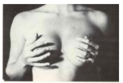
1XB (Radio Bossom) from the 1980's