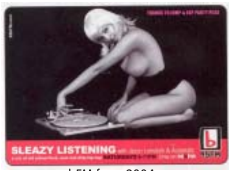
bFM from 2004

the difference between trance, house, heavy metal, rap, hip-hop, trash and thrash. Helpful for writing LPFM stations.