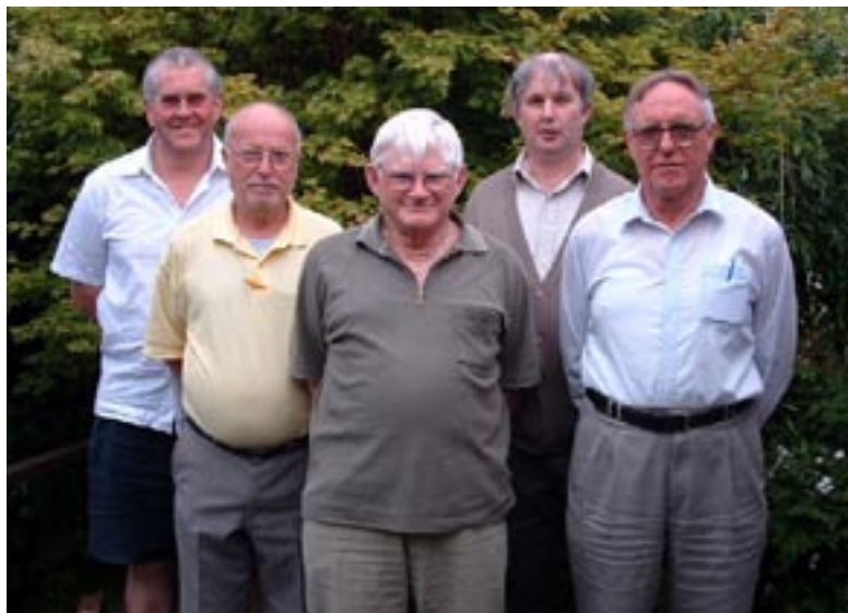
Canterbury Branch Gathering - 20 November 2005