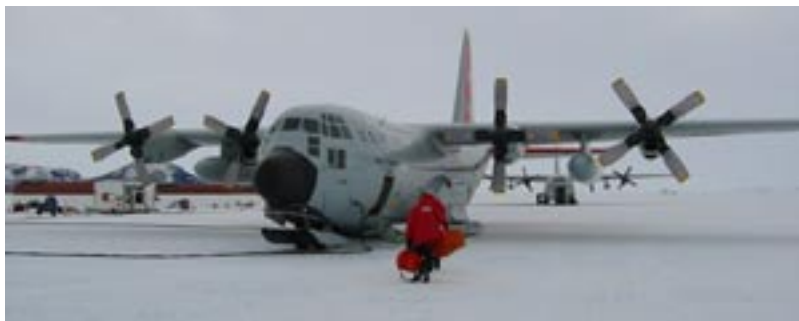
Ski equipped 130 Hercules at McMurdo