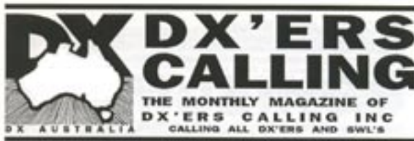
Masthead of DX'er's Calling the monthly magazine of DX Australia during the 1980's/90's