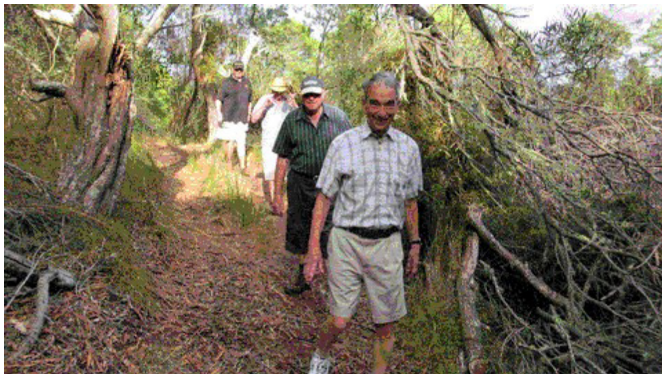
Bush Walkers