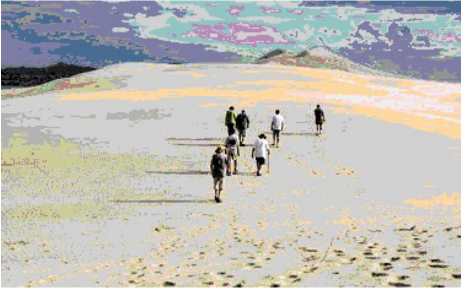
Intrepid DXers Ascending the Giant Mangawhai Dune – only 4 made the summit.