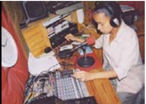
Starcom Cricket World Cup Promotion