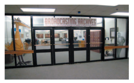
Entrance to Library of American Broadcasting, University of Maryland in College Park, MD.

Committee for the Preservation of Radio Verifications