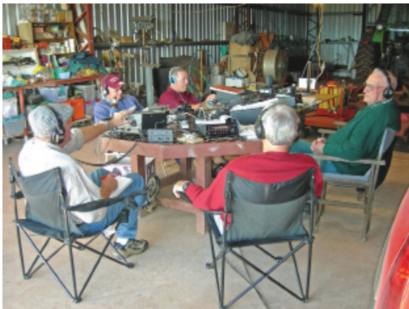
Some Kingaroy Photos