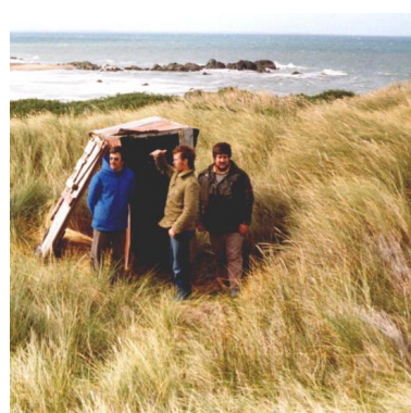
Left. Old photo (date unknown) of the 6 x 3 at the Riverton Rocks.