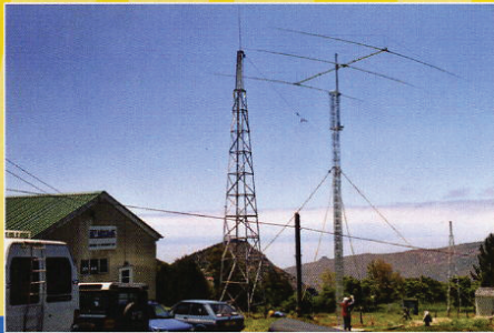
Radio St. Helena Day 2006 Revival Project