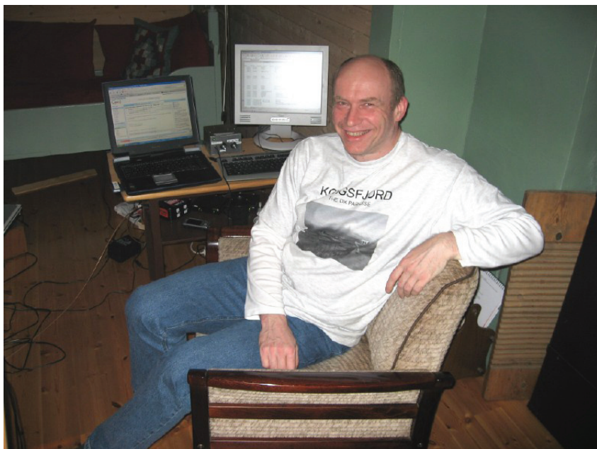
Pictures this page and previous page - the participants and equipment at the KONG DXpedition 2007.