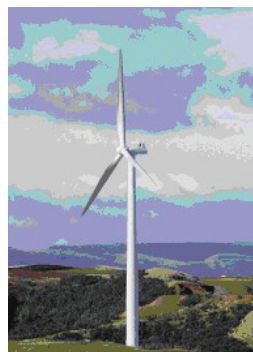
Wind Turbine at the Te Apiti site

QUARTZ HILL UPDATE According to the September newsletter of the Quartz Hill Users Group, antennas and all supporting gear are being dismantled during October/November and put in storage whilst Meridian Energy starts developing the site for its major Wind Farm. The club is still hopeful that it will be able to operate from Quartz Hill after the wind farm is built, but a critical issue is the compatibility of future amateur radio operations with the RF noise that may be generated by the wind farm. Discussions with other amateurs in Europe indicate that radio interference is not normally an issue in or around wind farms, but the club will not be able to make a decision on this issue until they have more substantive information about the level of radio noise that is likely to be produced by the specific wind farm technology chosen by Meridian Energy. In the meantime, the club is thinking about a new antenna farm at the site, on the assumption that RF noise will not be a problem.