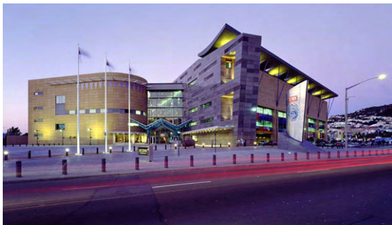
Te Papa Museum - Wellington

Wellington Area Branch meets Sunday, February 24, 130pm. Te Papa National Museum upstairs cafe. Planning for possible LPFM hunt during March, social news and chat so we look forward to seeing you there. We've got a good group of experienced DXers in Wellington and once a month we look forward to catching up so mark your calendars now. Future meeting dates are Sunday, March 30 at 1.30pm and Sunday April