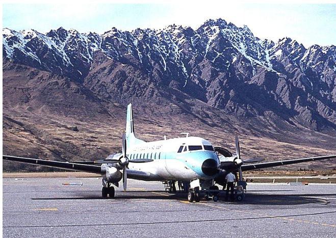
Mt Cook Airlines HS74 at Queenstown Airport