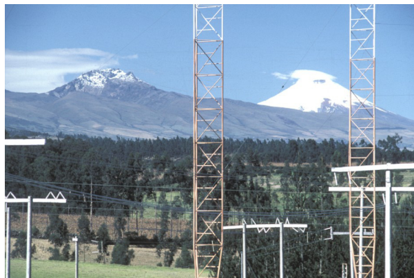
Pifo transmitter site Ecuador