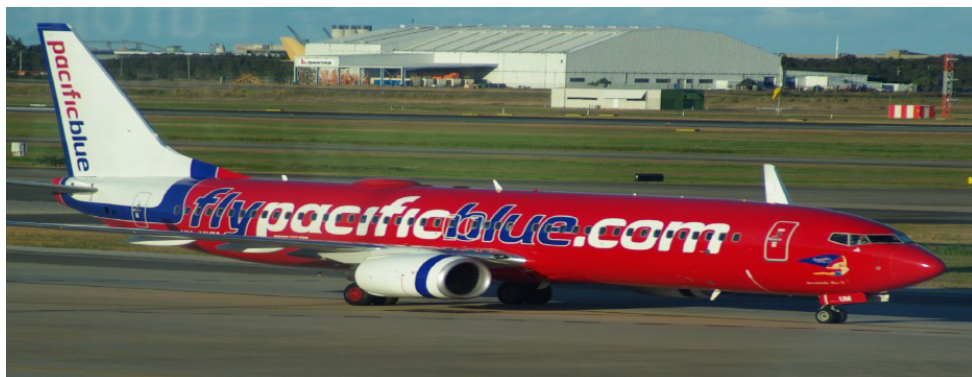
Brisbane airport late Thursday afternoon