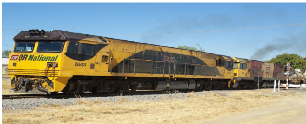
Queensland rail freight train on the line to Mt Isa - nearly 35 degrees.