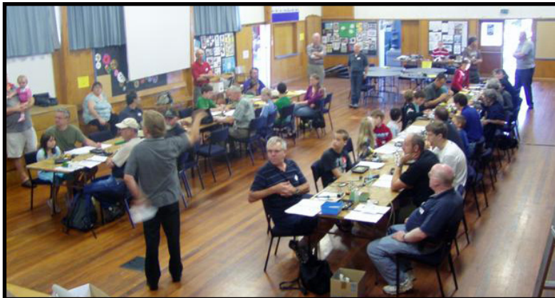
Christchurch Buildathon Jan 2010 Burnside Christchurch.

GROWING INTEREST IN RADIO Our colleagues in the NZART , with sponsorship support