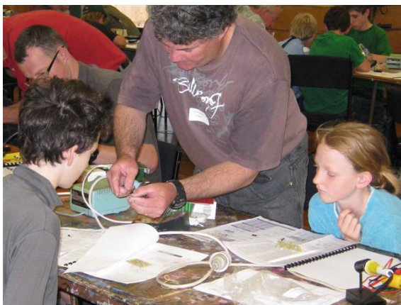
Christchurch Buildathon Jan 2010, Burnside Christchurch.