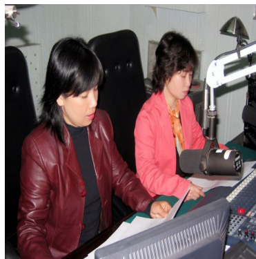
Announcers at work.

Voice of Shangri La. Kunming.Yunan.6035 kHz. Shangri-La is Yunnan People's Radio Voice, is the launch of our existing three independent radio stations covering the external one, is the only province's foreign broadcast media, the party and the government's "mouthpiece." Programs adhere to contemporary and border, Yunnan features, for the