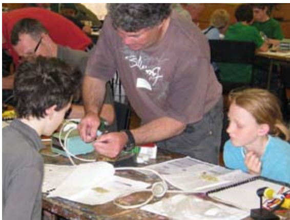
Christchurch Buildathon Jan 2010, Burnside Christchurch.