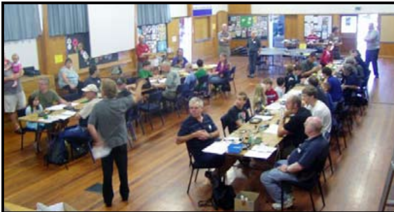
Christchurch Buildathon Jan 2010 Burnside Christchurch.

GROWING INTEREST IN RADIO Our colleagues in the NZART , with sponsorship support