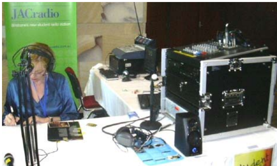
94FM World Press Freedom Day Studio