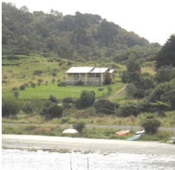
Sea Breeze Cottage