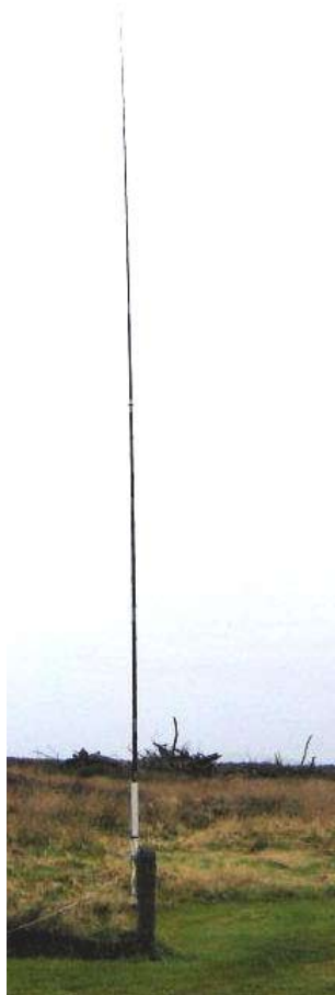
Squid pole aerial

The phaser test with the two ewes was disappointing as there were no North Americans to oppose the S. Americans it was not ideal conditions to conduct tests. The squid pole referred to is a telescopic fishing