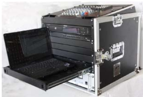
Radio in a box transmitter.

The portable "Radio In A Box" is a compact and mobile radio transmitter, which can be used to broadcast messages in post-disaster situations in Asia and the Pacific. It's a UNESCO product designed by an engineer at the Kuala Lumpur based Asia-Pacific Broadcasting Union (ABU). The 'box' contains a 30 watt FM transmitter, a small computer, microphones, CD/cassette player, digital audio recorder and all the other essentials needed to set up a radio station in an emergency situation or disaster area. These are now built by In a Box Inovations based in Melbourne, Australia.