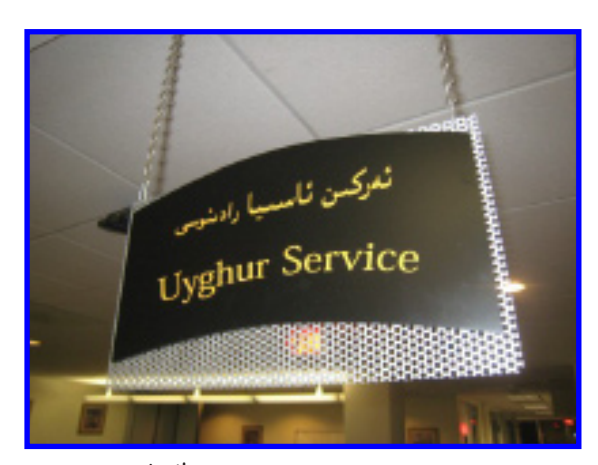
In the newsroom