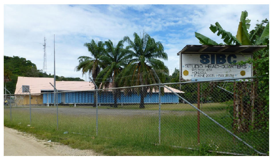
Sign says "SIBC Studio Headquarters PO Box 654 Honiara, Phone 20051, Fax 23159"

Bottom line. Email sibcnews@solomon.com.sb www.sibconline.com.sb Ph 20051 Fax 23159