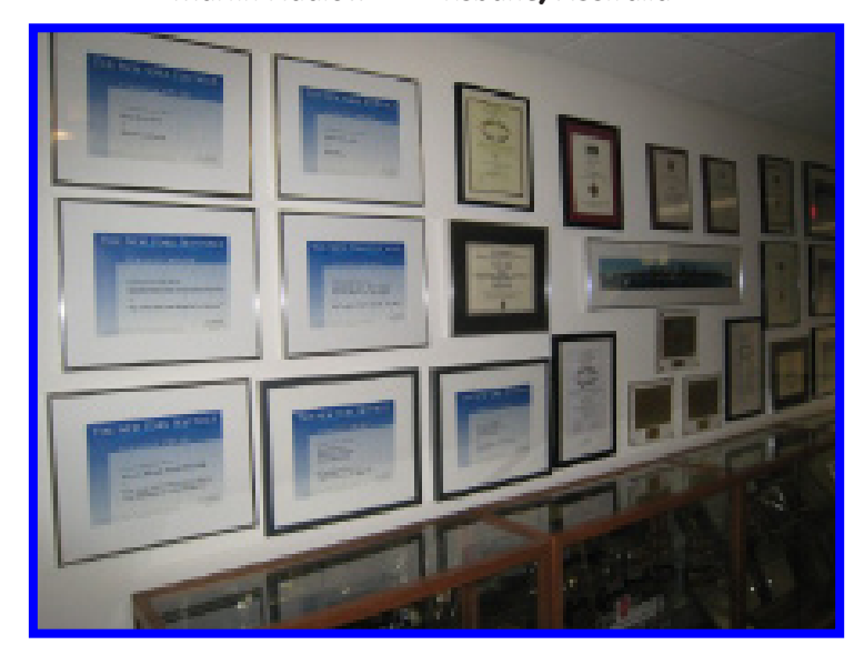
Some of RFA's awards