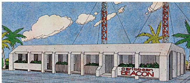
Caribbean Beacon QSL Card