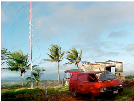
High winds from Cyclone Evan buffet the FM repeater station in Sigatoka,

You can read a fuller story and view more photographs at the HCJB Global website http://www.hcjb.org/hcjb-global-news/asia-pacific/two-christian-radio-outlets-in-fiji-remain-silent-2-months-after-cyclone.html