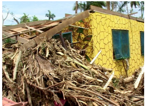
Cyclone Evan caused major damage to buildings in Samoa