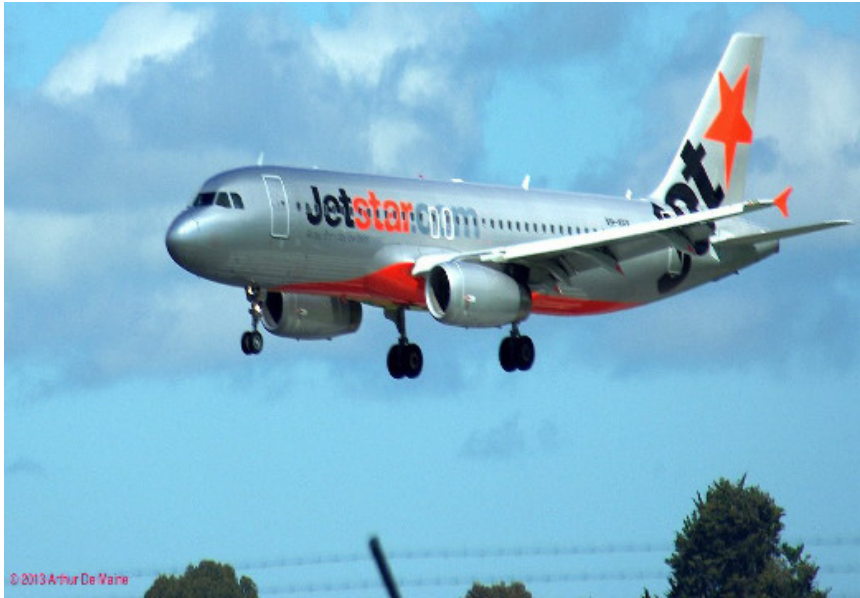
A couple of photos from Christchurch airport on the last day of September, Jetstar about to land and below is the Air NZ aircraft in the All Black colours about to take-off.