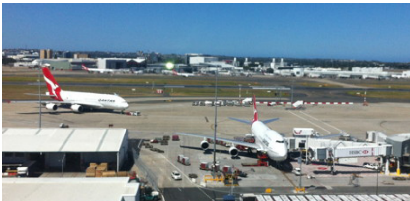
A couple of the new Qantas A380's at Sydney Airport.