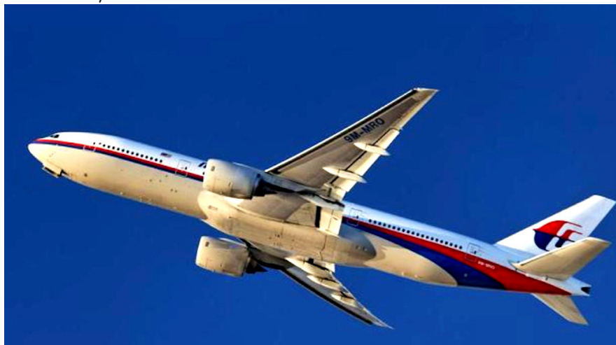
Malaysian Airlines Boeing 777-200ER