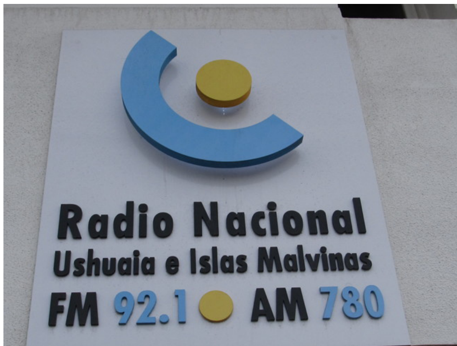
Photo of Radio Nacional Ushuaia e Islas Malvinas logo on building in Aargentina.