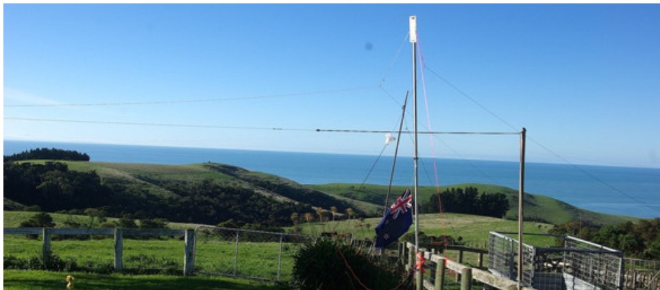
Above. Looking North – North East out to sea. The make shift masts to carry the long wires over the road leading to the sheep yards.