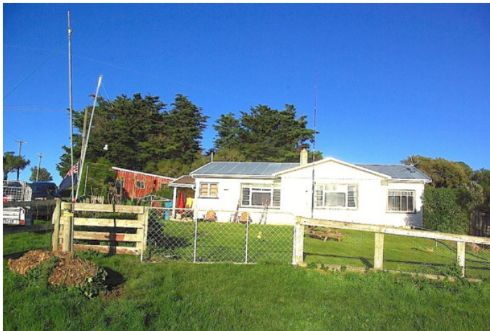
Looking back up to the house, Paul's squid pole in the centre of the lawn. Poles erected on the fence to carry the long wire aerials over the road.