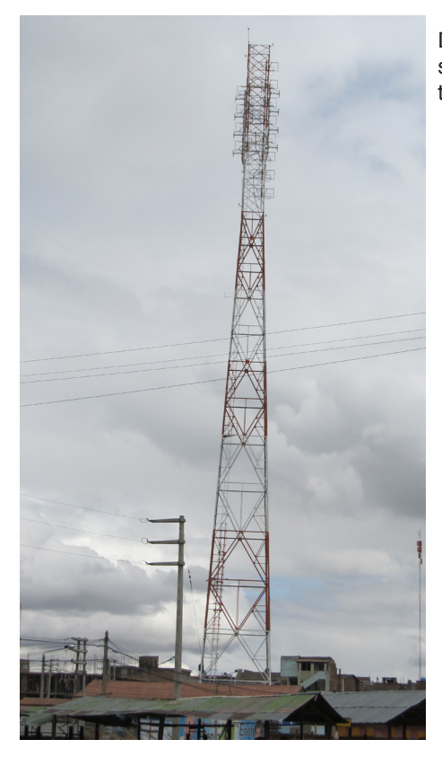
The tower for Panamerica in Huancayo, Perú. It is right in the middle of town by the north railway station. It is presumed for FM as well as TV.

Despite the no photography sign, Theo quickly snapped this picture promoting Radio María in the Ayacucho Cathedral!