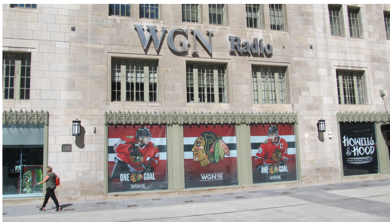
WGN Radio 720 AM, Chicago