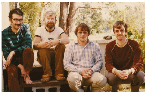
On one of our numerous dxpeditions