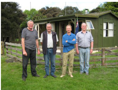
Some of the participants - an earlier visit