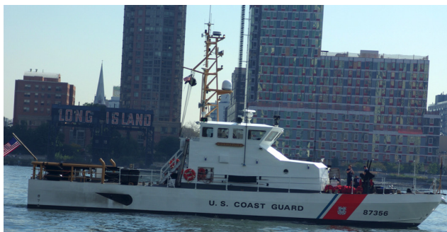
US Coast Guard Cutter in New York Harbor – September 2014 Arthur

regards, Peter Mott, ZL1PWM / ZMH292, Bay of Islands, New Zealand