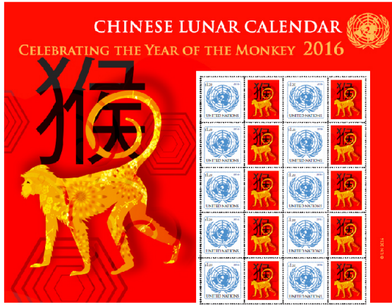
Year of the Monkey Stamp Design © 2016 United Nations Postal Administration. All rights reserved. Used with permission.

This is the new QSL card for Radio Free Asia covering the January - April 2016 period.