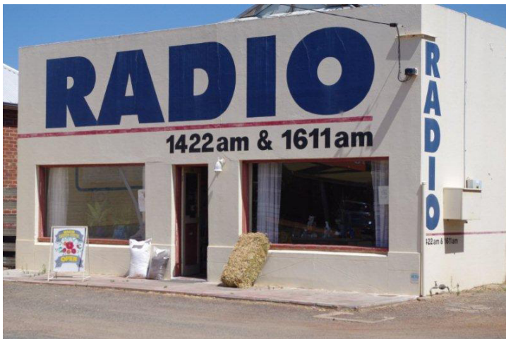
Great Southern Radio 1422 and its sister station Easy Listening 1611 broadcast out of Wagin.

Ray and Raewyn Crawford are continuing their epic voyage around Australia as grey nomads and are currently in the south of Western Australia. Ray sent a photo recently, which I reproduce below. It is great to see that truly local radio still exists.