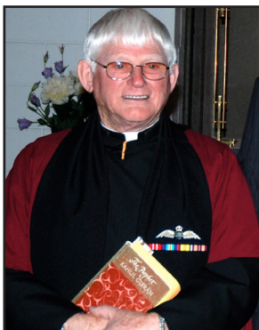
The guilty party!