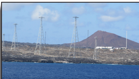
BaBCock Transmitter masts on Ascension Is