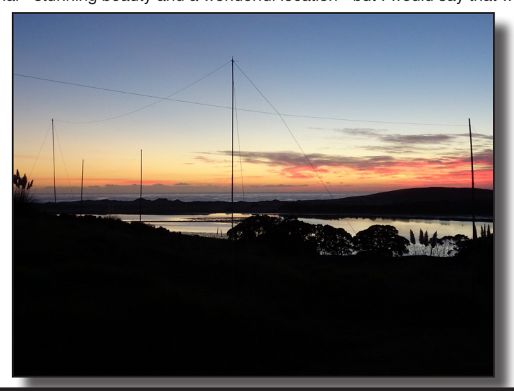
Photo of the month - This from Bryan Clark taken at the convention. For those who only get the paper version of the mag - you will miss out on the colour and may wonder what the fuss is all about - believe me it is wonderful and captures the magnificent essence that is Mangawhai - stunning beauty and a wonderful location - but I would say that wouldn't I?

Happy Travels to Arthur & Dorothy DeMaine: we wish them well. As a result of Arthur's absence, there will not be a Utilities column this month.