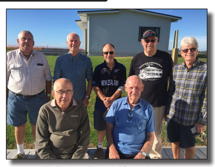
Life Members - Mangawhai Convention 2018

http://sdr1.radiodx.com:8073 http://sdr2.radiodx.com:8073 You will need the password - write to nzrdxlsdr@gmail.com for details.