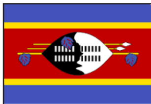
The flags of North Macedonia and eSwatini respectively