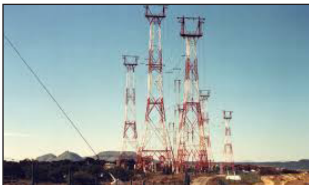
The Radio Liberty antenna masts

NEW STATION 11890 , Radio Nyawa Sarawak, *1000-1010, 27/11, open with music, male, Malaysian, comments id. “Radio Nyawa Sarawak”, “ www.radionyawasarawak.org ”, male and female comments. Clear signal. 25322 Manuel Mendez.